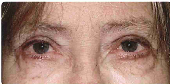
Blepharoplasty removes excess eyelid skin, improving appearance and vision.