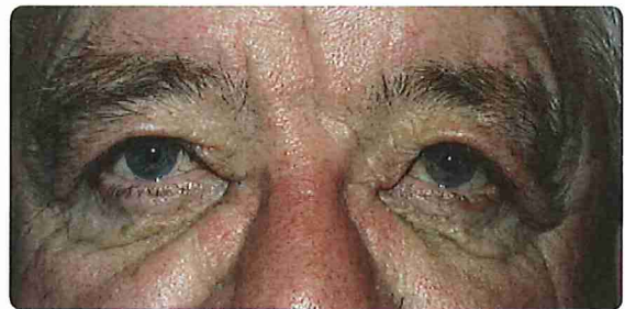
With ptosis surgery, the upper eyelid is returned to its normal position.

With ptosis surgery, the ophthalmologist strengthens the eyelid muscle by shortening it. This helps lift the droopy lid, improving vision as well as the eye's appearance.